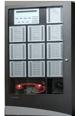
E3 Series Broadband