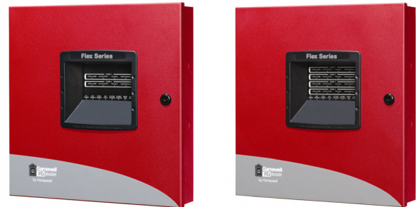
GWF402 (left) and GWF404 (right)