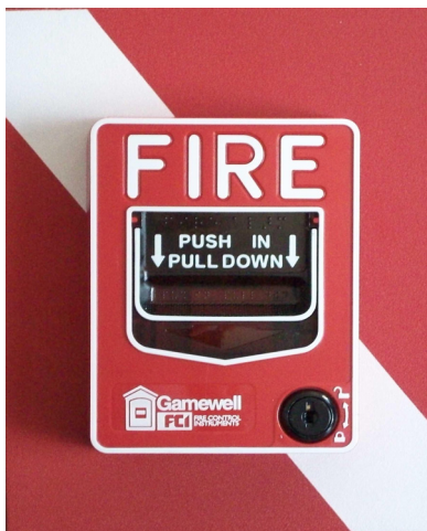
Figure 1 NYC-Plate

The NYC-Plate provides the backplate for the manual pull station. (See Figure 1).